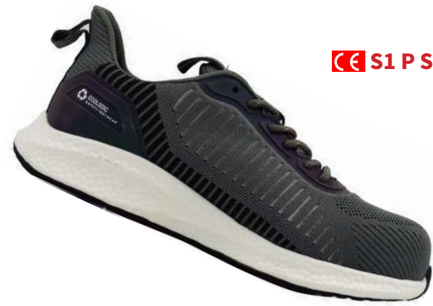
CE S1 P SRC