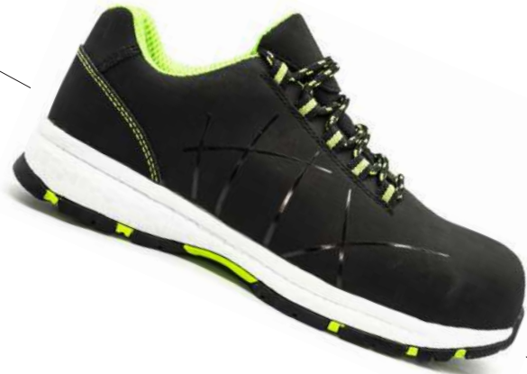
CE S1 SRA P