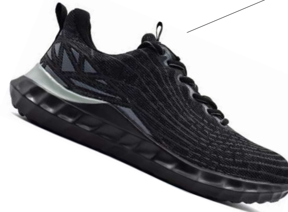
CE S1P SRC 01 FO SR