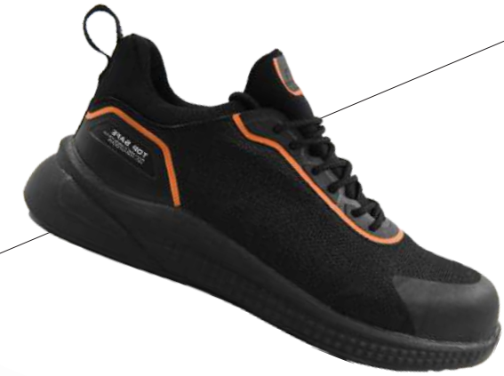
CE S1P SRC