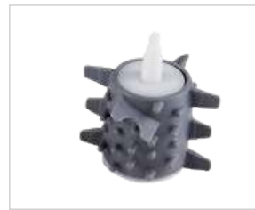
Peel garlic parts