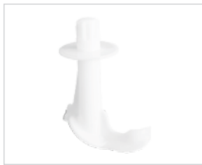
Knead dough parts