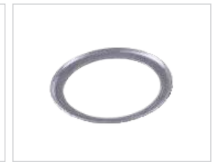
Non-slip silicone rubber pad