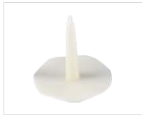
Whisk egg white parts