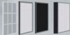
Initial filter (washable) HEPA filter H11 Carbon filter (High Iodine) Multi-layer composite filter (41mm)

Multi-layer composite filter Efficient filtration of tiny particles